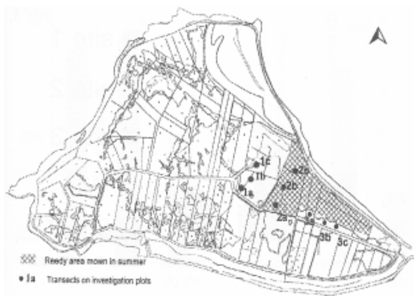
Figure 1. Location of research area

The investigation was conducted in June–July 2005.