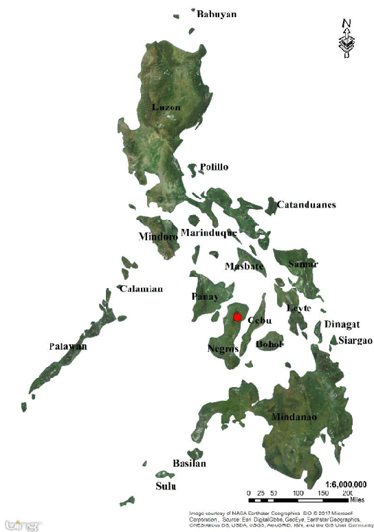
Fig. 2. Distribution of C. santossilvai sp. n

1) Pronotum of C. santossilvai sp. n. with irregular spots of yellow-brown pubescence and very coarse transverse wrinkles. Pronotum of C. bukejsi sp. n. without irregular spots of yellow-brown pubescence, with coarse punctures, and