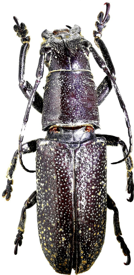
Fig. 4. Holotype of C. bukejsi sp. n.

Type material. Holotype, female: Philippines: Luzon Isl., S Camarines, Tigaon, 03.2015, local collector leg. (DUBC).