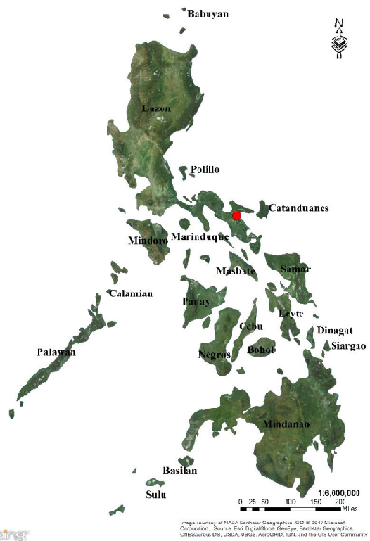
Fig. 5. Distribution of C. bukejsi sp. n.