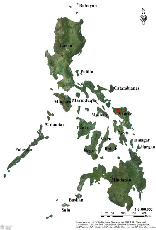
Fig. 7. Distribution of C. miroshnikovi sp. n.