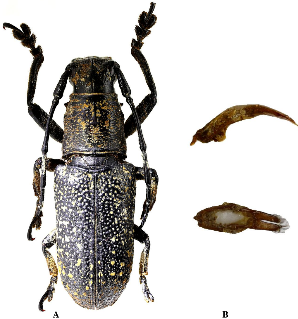
Fig. 1. Holotype of C. santossilvai sp. n. (A – habitus, B – male genitalia: aedeagus (above) and paramera (below))

which impressed near scutellum. Elytra covered with small spots of yellow pubescence, more distinct in apical part. Base of elytra slightly concaved at shoulders, in apical part along suture located narrow flat elevation as flat keel. Apex of elytra rounded, with many long hairs. Length of