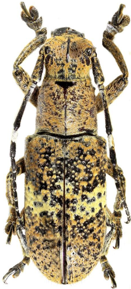
Fig. 8. Habitus of C. stanleyi dela Cruz, Adorata, 2012

Elytra black, parallel-sided, with not concaved basis at shoulders, slightly flattened dorsally, without visible humps behind shoulders, with very coarse punctation, with narrow flattened keel-shaped elevation in apical part along suture. Elytra covered with dense yellow-brown pubescence, with wide band of irregular white spots in middle part, some of these spots connected together, forming irregular zig-zag-shaped lines. Apex of elytra rounded, with many long hairs. Length of elytra: 14.2 mm, width of