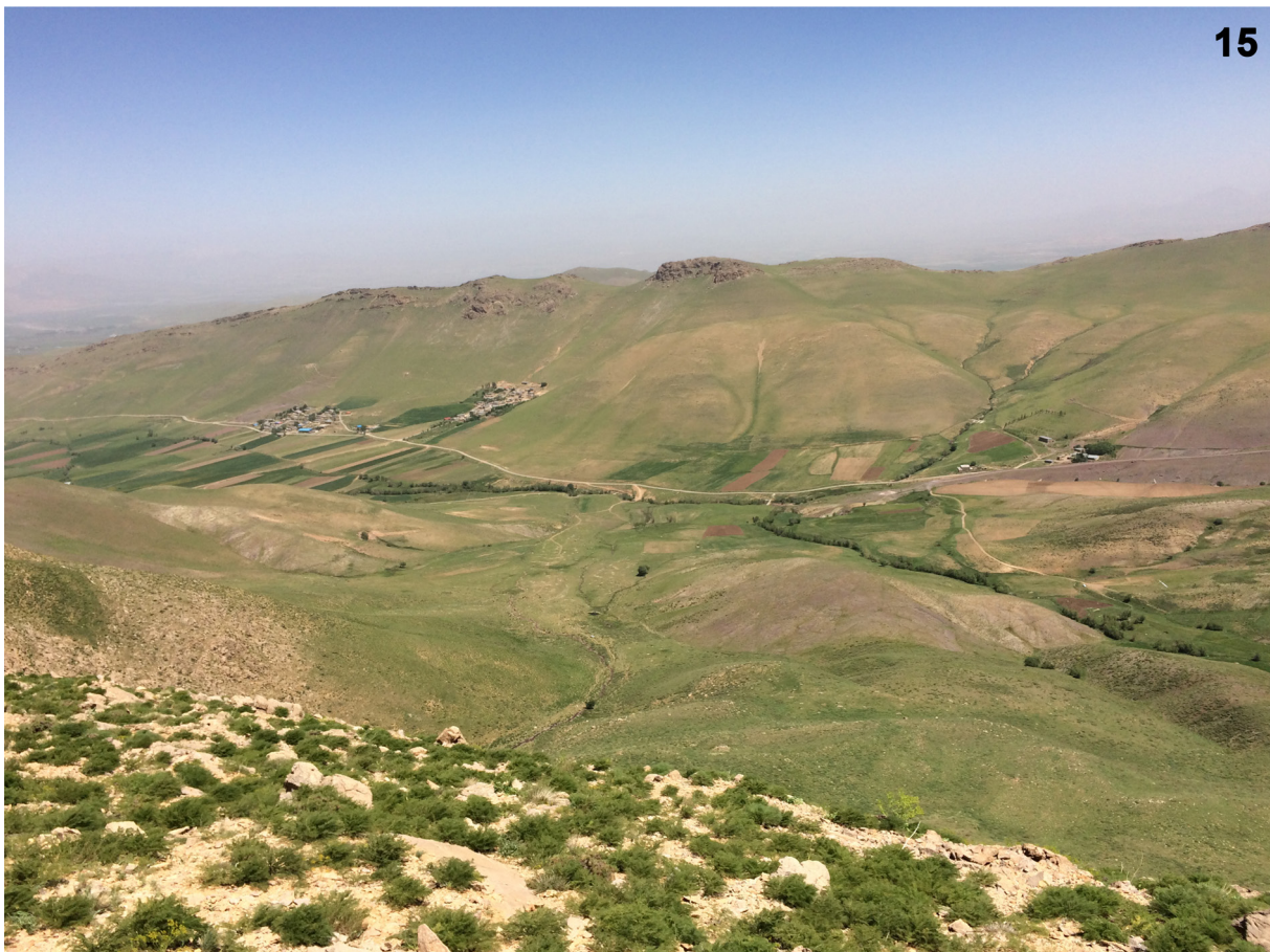
Fig. 15. The type locality of Bruchus lorestanus sp. n., Lorestan, Iran.

10 – пенис; 11 – вершина пениса; 12 – парамеры; 13 – вершина парамер; 14 – VIII скрытый сегмент самца (тергит и стернит).