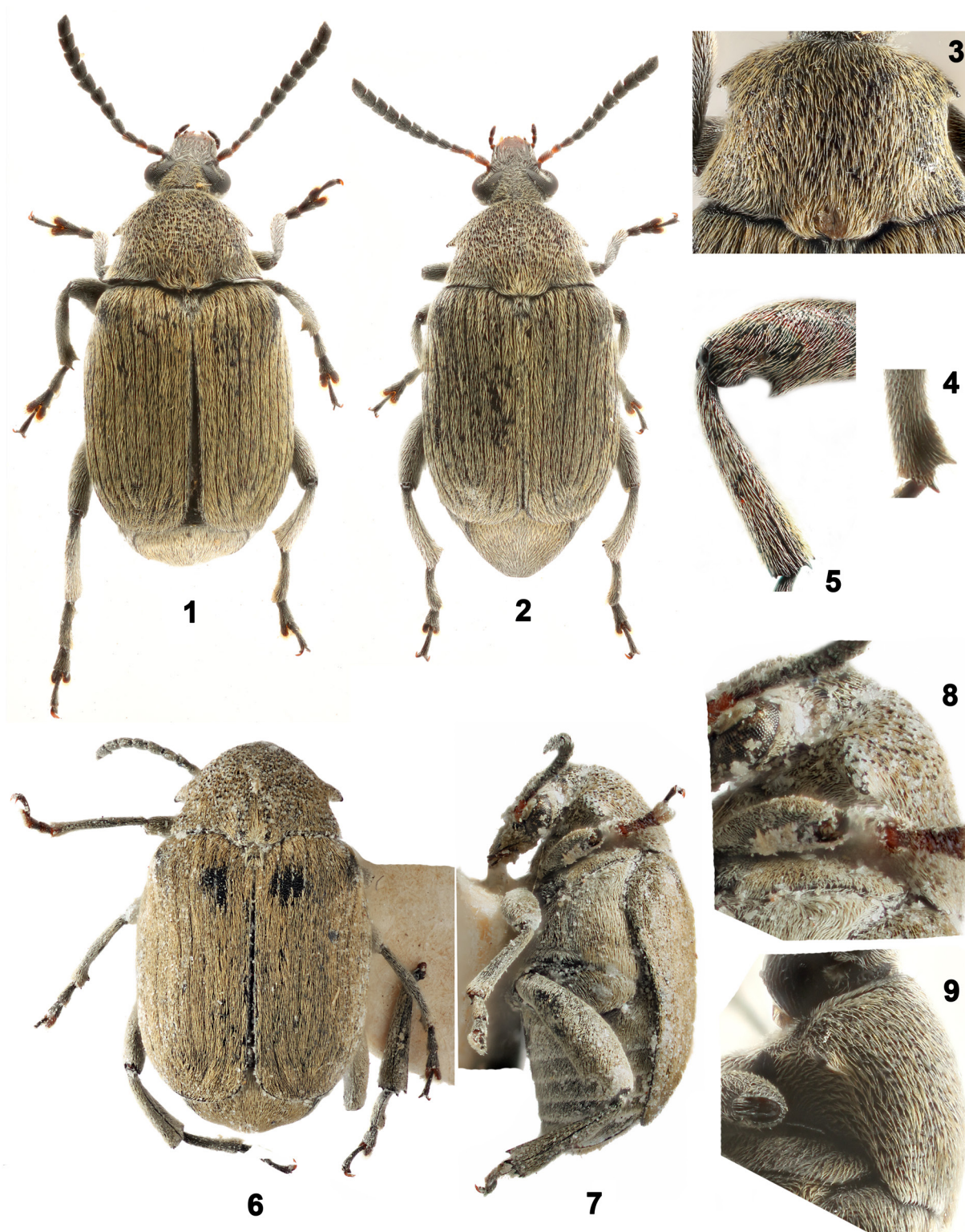
Figs 1–9. Species of the genus Bruchus . 1–5, 9 – B. lorestanus sp. n.; 6–8 – B. mirabilicollis Ter-Minassian, 1968. 1, 6 – holotype, male, dorsal view; 2 – paratype, female, dorsal view; 3 – pronotum, dorsal view; 4 – apex of mesotibia; 5 – apex of hind femur; 7 – holotype, male, lateral view; 8–9 – pronotum, lateral view. Рис. 1–9. Виды рода Bruchus . 1–5, 9 – B. lorestanus sp. n.; 6–8 – B. mirabilicollis Ter-Minassian, 1968. 1, 6 – голотип, самец, вид сверху; 2 – паратип, самка, вид сверху; 3 – переднеспинка, вид сверху; 4 – вершина средней голени; 5 – вершина заднего бедра; 7 – голотип, самец, вид сбоку; 8–9 – переднеспинка, вид сбоку.