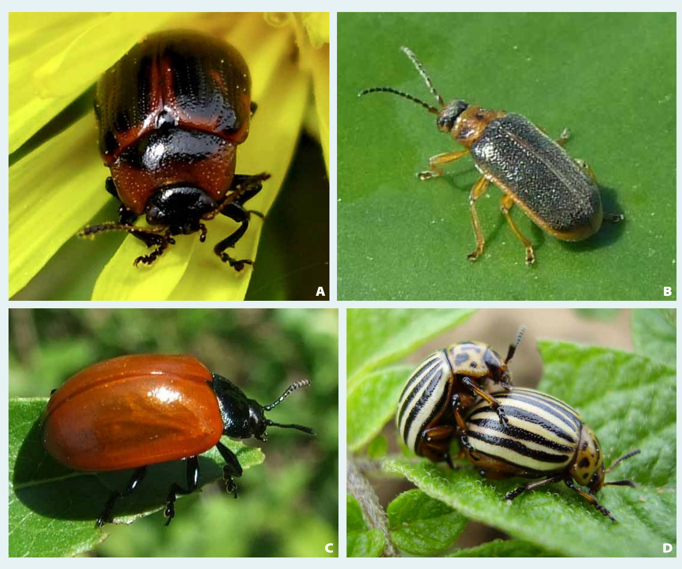
Figure 2. Leaf-beetles: A – Gonioctena viminalis (Linnaeus); B – Galerucella nymphaeae (Linnaeus); C – Chrysomela populi Linnaeus; D – Leptinotarsa decemlineata (Say).