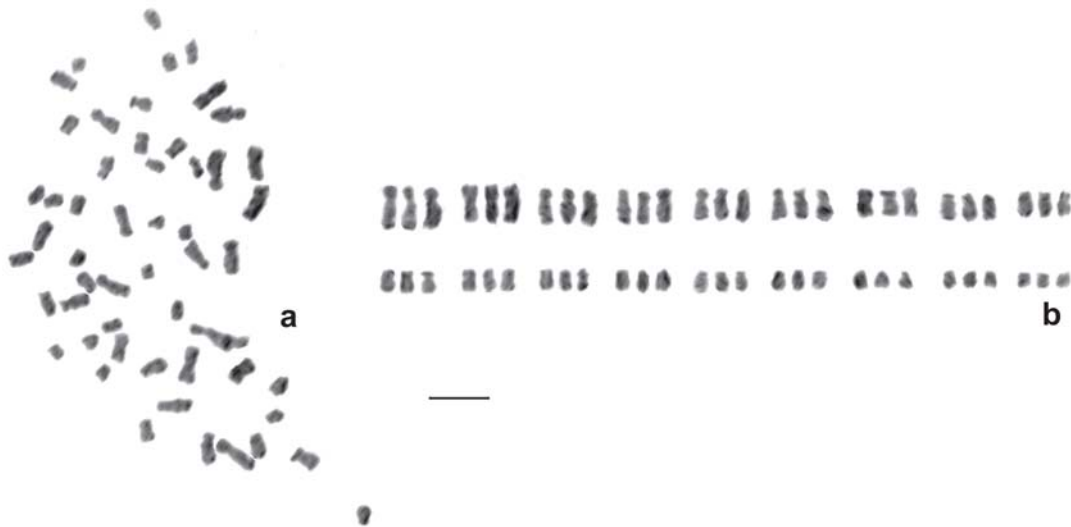
Fig. 2, a, b. Chromosomes of triploid race of Aporrectodea rosea . a - mitotic metaphase ( 3n = 54 ); b - karyogram. Bar = 10 \mu\text{m} .

in Europe (Muldal, 1952; Vedovini, 1973). In the Ukraine we have found diploid worms only in Chernigiv Province; triploid representatives were found in Zhytomyr, Chernigiv, and Kyiv Provinces. The chromosomes of the triploid race are slightly smaller than in diploid one. All chromosomes are two-armed (NF = 108) (Fig. 2).