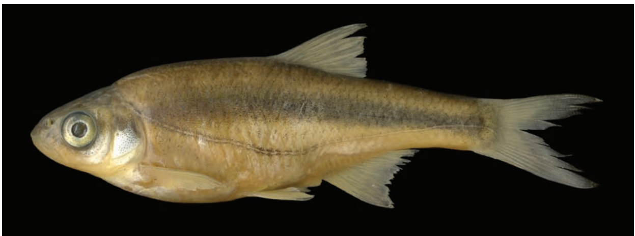
Fig. 6. Alburnoides ohridanus , PZC 232, 58.3 mm SL.