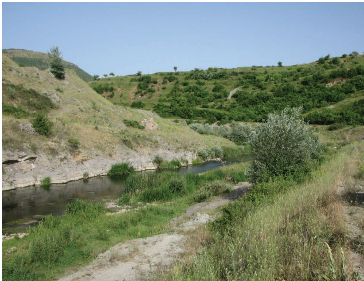
Fig. 10. The type locality of Alburnoides devolli sp. nov., Devoll River at the road SH3.

Description. See Table 1 for morphometric data of holotype and 14 paratypes. The body is deep: depth at the dorsal fin origin is 28–33% SL. In most specimens there is a slight to considerable hump just behind the head and the head dorsal profile is slightly concave, in the largest examined specimens in particular. The upper and lower profiles of the body are almost equally convex. The snout is markedly rounded in front of the nostrils; no fleshy projection is present (Fig. 4). The mouth is almost terminal, and the uppermost point of the mouth cleft is about the level of the pupil. The mouth cleft (in lateral view) is straight and the cleft is considerably slanted. The interorbital space is not wide, its width 30–35% HL, and the eye horizontal diameter enters interorbital width 1.1–1.4 times. The eye horizontal diameter, 23–28% HL, is slightly to markedly smaller than the snout length,