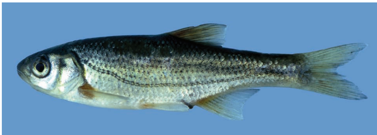
Fig. 11. Alburnoides fangfangae sp. nov., tributary of Gianci Reservoir, PZC 482, 55.2 mm SL.

The ventral keel between the pelvic fin insertions and the anal papilla is poorly developed and commonly scaled at \frac{1}{2} to \frac{3}{4} of its length or completely scaled (Table 4).