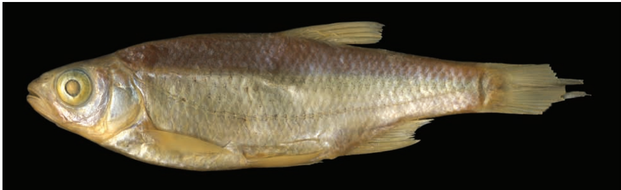
Fig. 7. Alburnoides cf. ohridanus (Skadar Lake), NMW 55486, 59.7 mm SL.