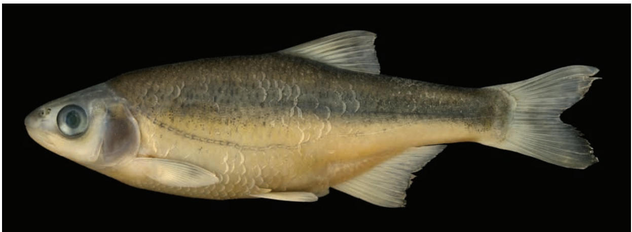
Fig. 5. Alburnoides cf. bipunctatus (Danube), PZC 482, 77.6 mm SL.