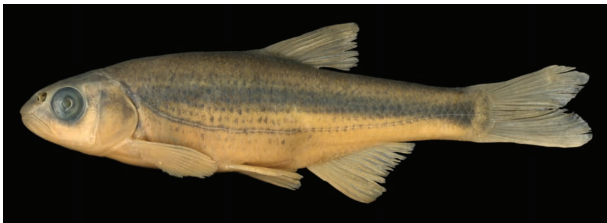
Fig. 3. Alburnoides fangfangae sp. nov., male paratype, PZC 481, 72.5 mm SL.

ined paratypes have 2.5–4.2 pharyngeal teeth. Teeth are hooked at the tip and not serrated below it.