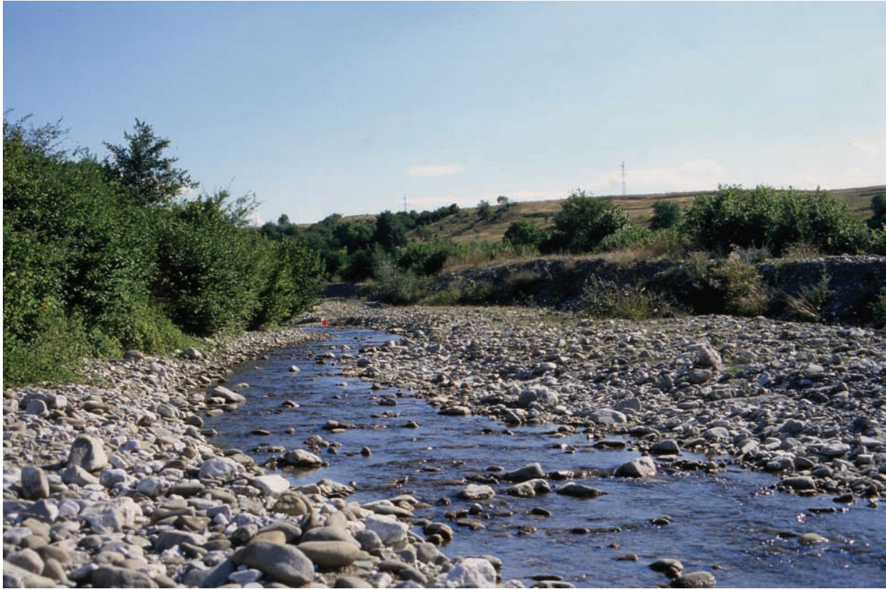
Fig. 9. The type locality of Alburnoides fangfangae sp. nov., a tributary of Osum River at the road SH3 near Selenica.

bipunctatus ) located in front of vs. slightly behind the dorsal fin insertion in A. cf. ohridanus and A. devolli sp. nov. with, modally, 12\frac{1}{2} – 13\frac{1}{2} and 12\frac{1}{2} anal fin branched rays, respectively (Figs. 4, 7).