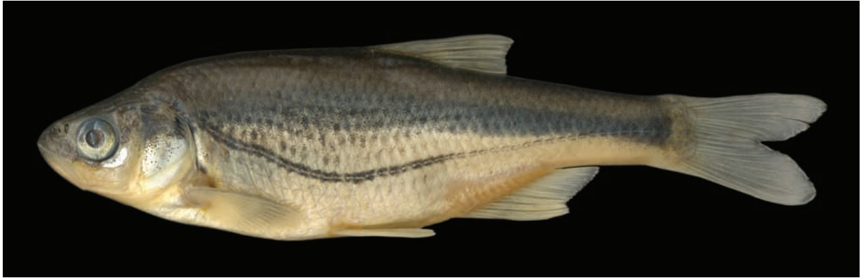
Fig. 4. Alburnoides devolli sp. nov., holotype, female, NMW 95278, 89.1 mm SL.