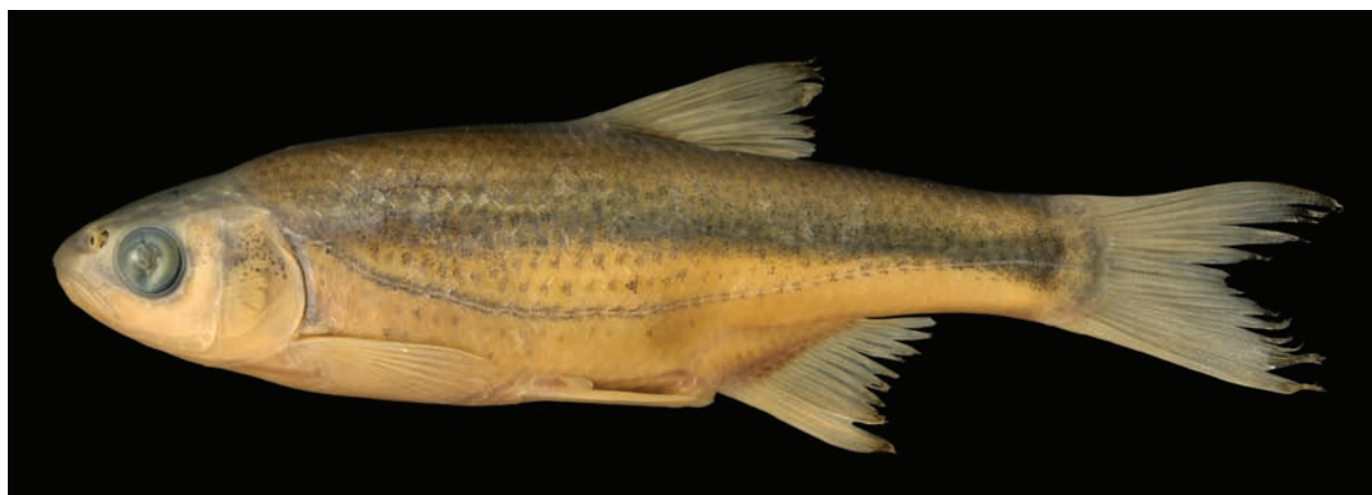
Fig. 2. Alburnoides fangfangae sp. nov., holotype, female, NMW 95276, 69.2 mm SL.

14½ (1) branched rays (Table 3). The anal fin outer margin is moderately to markedly concave with the lower apex of the fin rounded. The anal fin origin is usually somewhat in front of the posterior end of the dorsal fin base. Pelvic – anal fin origin distance is short, 15.5–20% SL, and the end of the pelvic fin almost reaches the origin of the anal fin or reaches it in mature males (Figs. 2, 3). The caudal fin is moderately forked, its lobes slightly pointed (Fig. 2) to