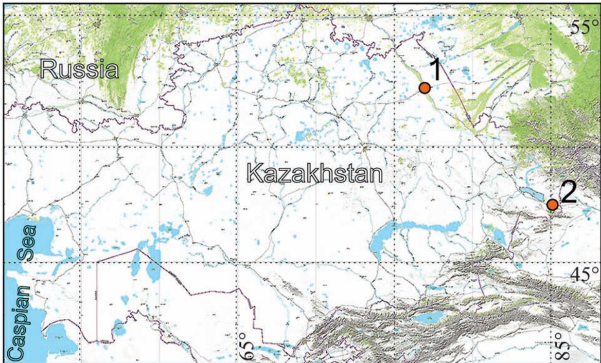
Fig. 1. Location of Indarctos localities in Kazakhstan. 1 – Pavlodar (Gusinyi Perelet), 2 – Kalmakpai.

margin. The tooth is assigned to a young individual and seems to be only beginning to erupt. This is confirmed not only by the absence of roots but also by numerous enamel folds of the masticatory surface, which are absent or inconspicuous on teeth, which began to wear.