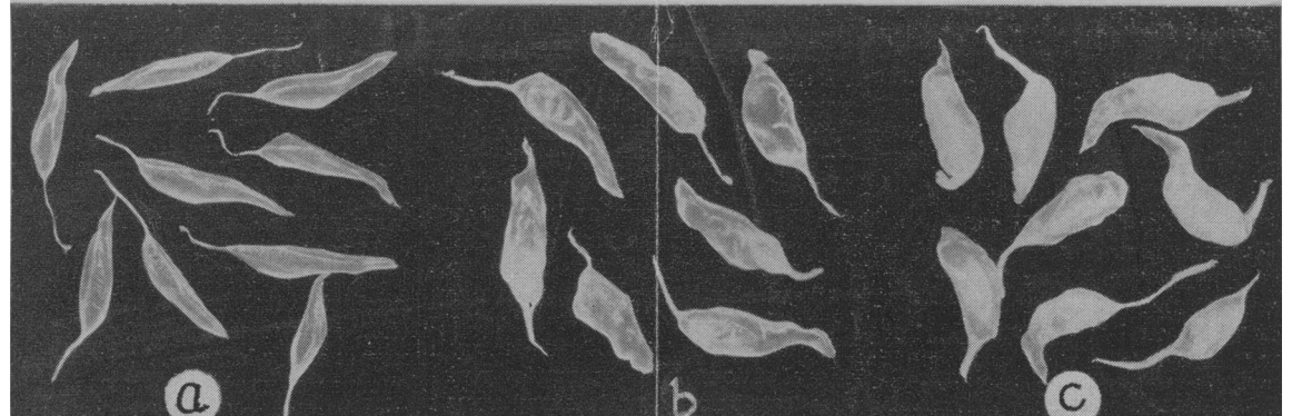
Granulation in a Valencia orange. ABOYE LEFT: Granulation shown in a cross section of the stem end. ABOYE RIGHT: Cross section of the same fruit cut near the center, with no indication of granulation. BELOW: Showing (a) healthy juice sacs; (b) moderately granulated sacs; and (c) badly granulated sacs.