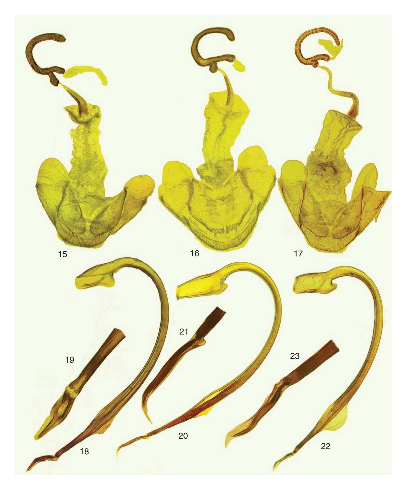
Figures 15–23. Macroilleis species. Penis and female genitalia: (15, 18, 19) M. hauseri (Mader); (16, 20, 21) M. borneensis sp. nov.; (17, 22, 23) M. chapuisi (Crotch); (15–17) female genitalia; (18, 20, 22) penis; (19, 21, 23) apical sclerite of penis.