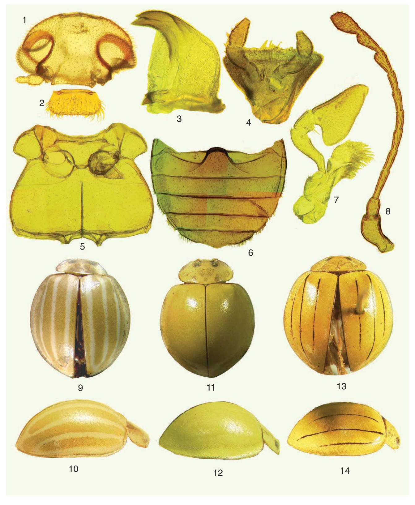
Figures 1–14. (1–10) Macroilleis hauseri (Mader); (11–12) Macroilleis borneensis sp. nov.; (13, 14) Macroilleis chapuisi (Crotch). (1) Head, frontal; (2) labrum; (3) mandible; (4) labium; (5) meso-metathorax; (6) abdomen of female; (7) maxilla; (8) antenna; (9, 11, 13) body dorsal view; (10, 12, 14) body lateral view.