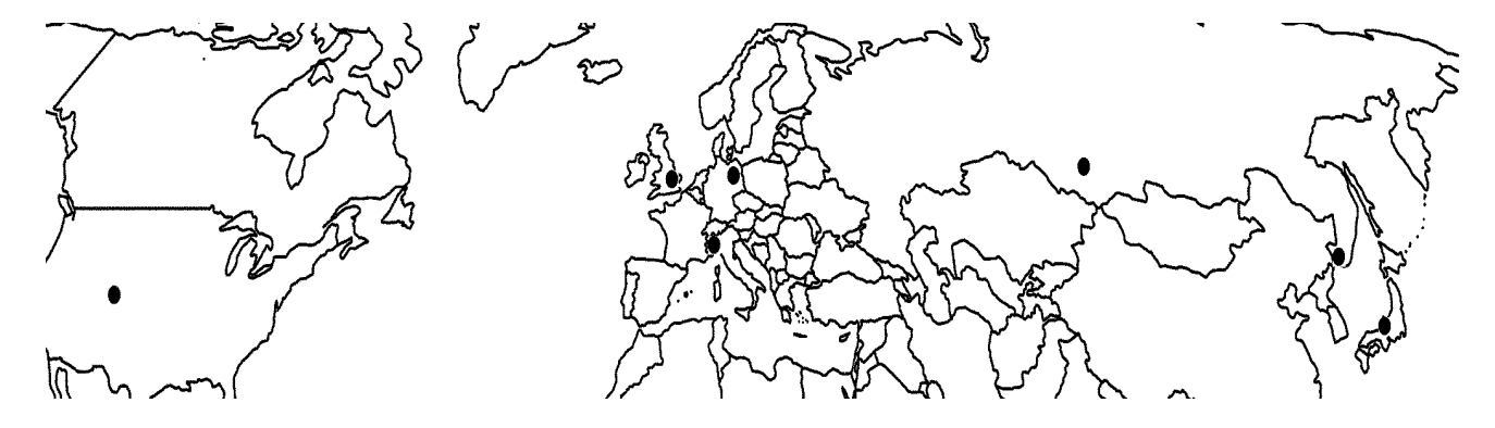
Fig. 1 Map of collection sites (black circles).

ny, 2008), Turin (Italy, 2006), Gornoaltaysk, Vladivostok (Russia, 2008), and Kyoto (Japan, 2010) (Fig. 1).