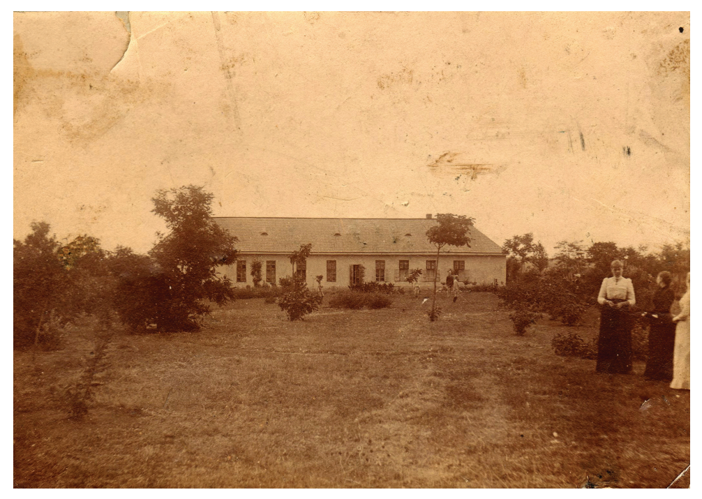
Figure 2. The house in the Nyáras district of Őrszentmiklós in 1891. This is where Sajó set up his laboratory.

fined by the American cultural entomologist Hogue (1983). The interesting aspect of this hypothesis is that the so-called Ezekiel's Wheel, which is often depicted as two wheels interlaced at right angles and carried by the cherubim, might be the transformed description of the dung pill. Thus, the association of a scarab dung ball with a wheel might not be a foreign thought of Middle Eastern ancient people" (quoted from Scholtz 2008).