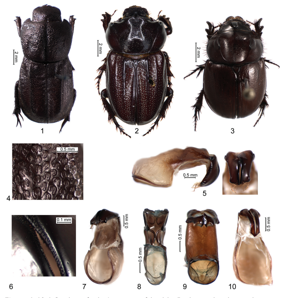
Figures 1–10. 1–3 Habitus of males 4 punctation of elytral disc 5 aedeagus in lateral view and parameres in dorsal view 6 serration of medial margins of parameres 7–10 aedeagus in ventral view 1, 4–7 Stenos ternus costatus Karsch, holotype 2 Aegidium colombianum Westwood 3 Orphnus macleayi Laporte de Castelnau 8 Hybalus cornifrons (Brullé) 9 Aegidium parvulum Westwood 10 Orphnus compactus Petrovitz.

tures. Middle and hind tibiae without ridges on outer sides, rugosely punctate. Middle tibiae have 2 apical spurs, outer spur about twice as long as inner one. Hind tibiae with 2 spurs (outer spur about 1.5 times longer than inner one) and with modified spur-like basal tarsomere (Fig. 13). Tarsi of middle tibiae are absent but according to the picture provided by Karsch (1887) the specimen had middle tarsi modified to spurs similar to those of hind legs. Stridulatory area on hind coxae present.