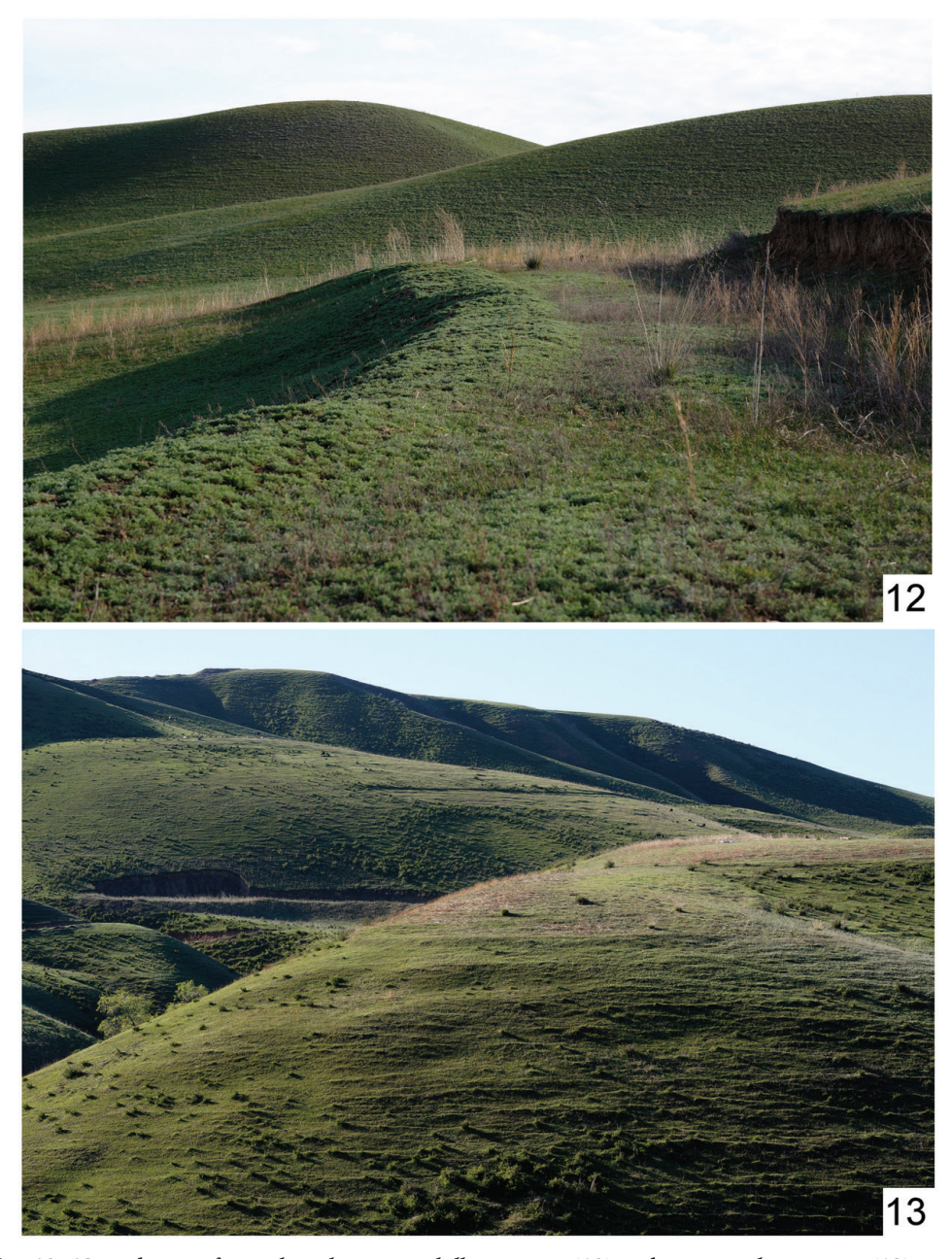
Figs 12, 13. Habitats of Pseudotaphoxenus achillei sp. nov. (12) and P. tarantsha sp. nov. (13).

Dorsum and legs brownish black; mandibles, and distal segments of tarsi slightly paler, reddish; palpi yellowish brown.