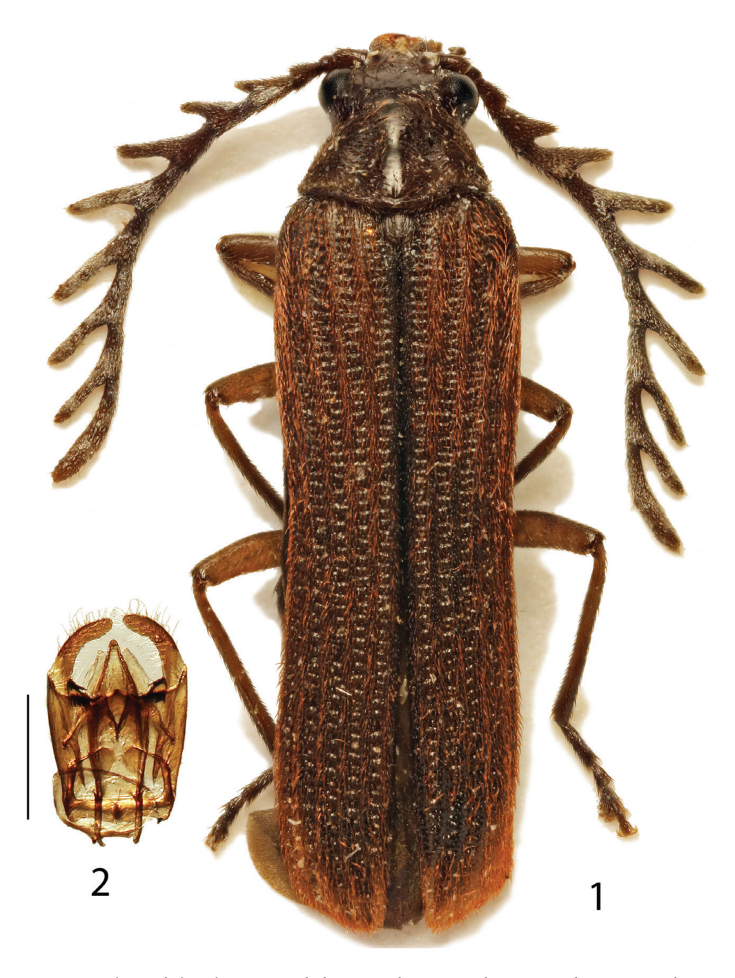
Figs 1–2. Drilonius fedorenkoi sp. nov., holotype, male: 1, general view; 2, aedeagus, ventral view. Scale bar: 0.5 mm.