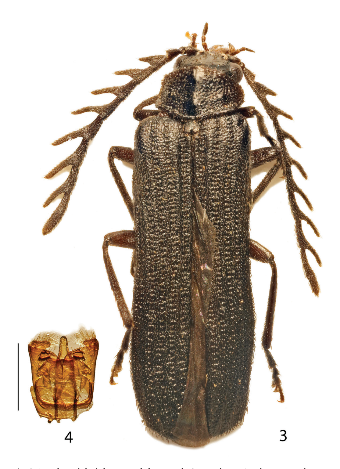
\textbf{Figs 3-4.} \ \textit{Drilonius holzschuhi sp. nov.}, \ \text{holotype, male: 3, general view; 4, aedeagus, ventral view.} \\ \textbf{Scale bar: 0.5 mm.}