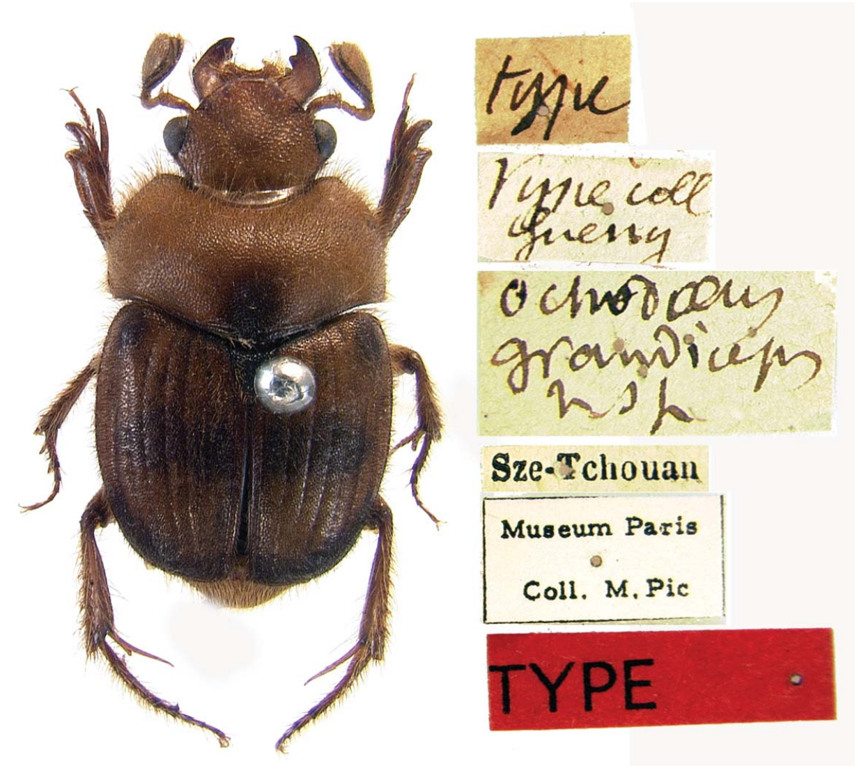
Figure 1. Holotype of Ochodaeus grandiceps Fairmaire (MNHN), now Nothochodaeus grandiceps, with labels.

As discussed in the previous section, the type locality of O. grandiceps is Sichuan, China. In the Coleopterorum Catalogus , Arrow (1912) listed O. grandiceps from "Westchina." Blackwelder (1944), in his Neotropical beetle checklist from around thirty years later, erroneously listed O. grandiceps Fairmaire as occurring in the West Indies. I can find no intervening works that provide a reason as to why such a mistake was made by Blackwelder. Presumably following Blackwelder, Peck (2005) listed O. grandiceps