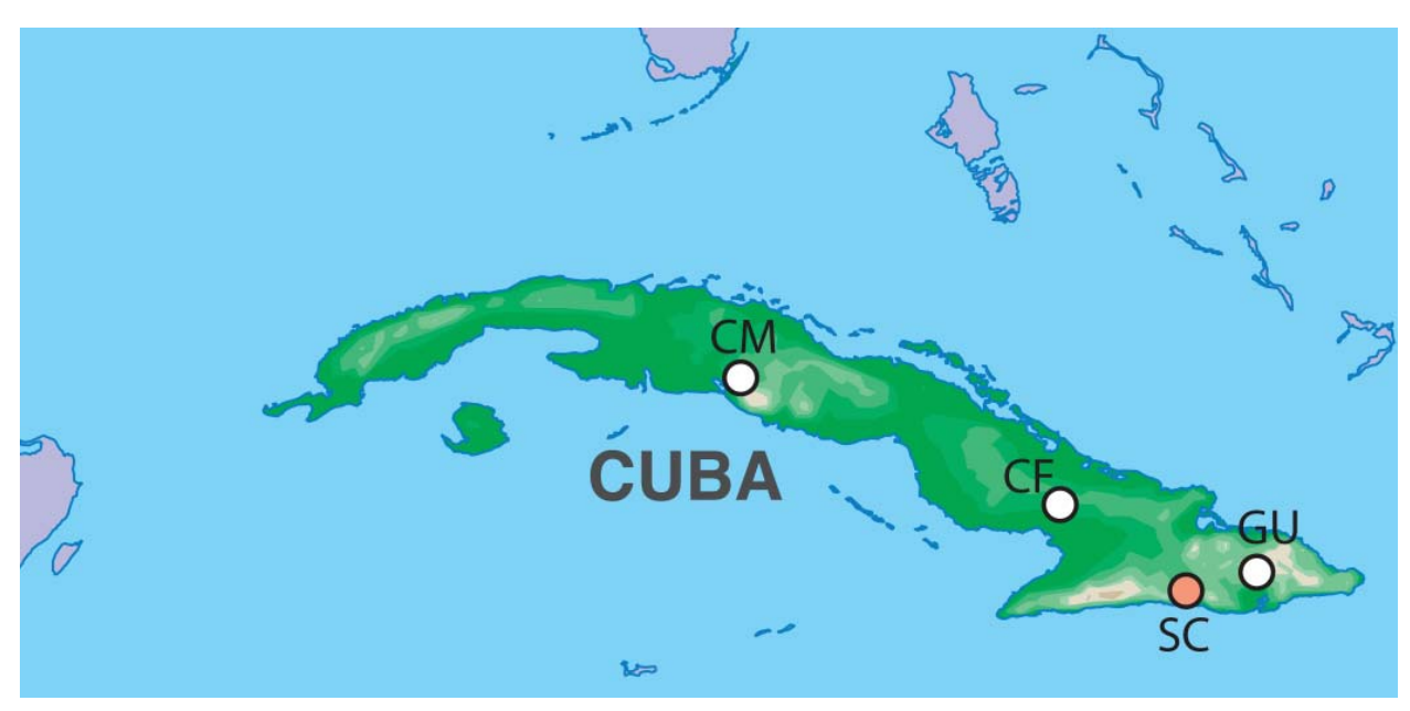
Figure 5. Distribution of Parochodaeus specimens from Cuba (circles) with the type locality of P. perdidus , n.sp., indicated in orange. Provincial abbreviations shown: CF = Cienfuegos, CM = Camagüey, GU = Guantánamo, and SC = Santiago de Cuba.

Distribution. (Fig. 5) CUBA: CAMAGÜEY: Galbis (1); CIENFUEGOS: Soledad, nr. Cienfuegos (1); GUANTÁNAMO: San Carlos (1); SANTIAGO de CUBA: Vista Alegre (4).