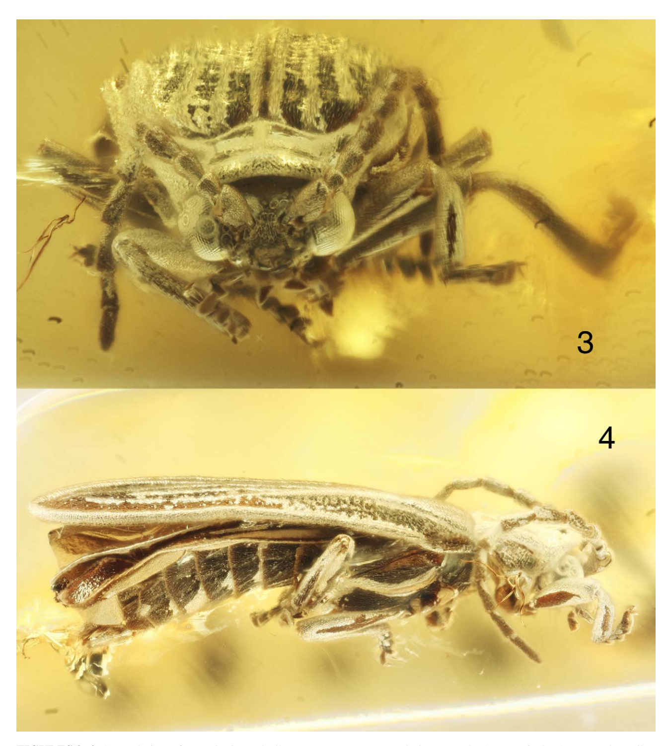
FIGURES 3–4. General view of Protolopheros hoffeinsorum gen. n., sp. n., holotype male. 3—anteriorly; 4—same, laterally.

Diagnosis. Protolopheros gen. n. may be unmistakably referred to the erotine complex of net-winged beetles due to a combination of characters, above all the antennal structure, the very characteristic pronotal pattern and strong elytral costae with evident reticulation (Fig. 1). Based on the erotine key (Kazantsev, 2004), the new fossil genus would key to Lopheros Leconte, 1881, at the same time easily distinguishable from Lopheros and related genera ( Aplatopterus Reitter, 1911, Eulopheros Kazantsev, 1995) by the short, but conspicuous antero-lateral pronotal carinae (Fig. 1), stout humeral elytral costa (costa 4) and almost obsolete proximally elytral costa 3, combined with irregular elytral reticulation (Fig. 1). Aplatopterus was not included in the 2004 key as not valid at that time, but was consequently validated (Kazantsev, 2012a) on the basis of a cladistic analysis (Kazantsev, 2010).