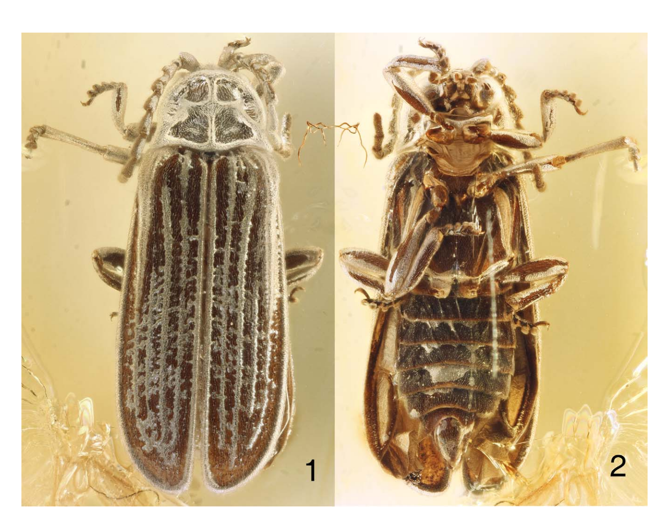
FIGURES 1–2. General view of Protolopheros hoffeinsorum gen. n., sp. n., holotype male. 1—dorsally; 2—same, ventrally.