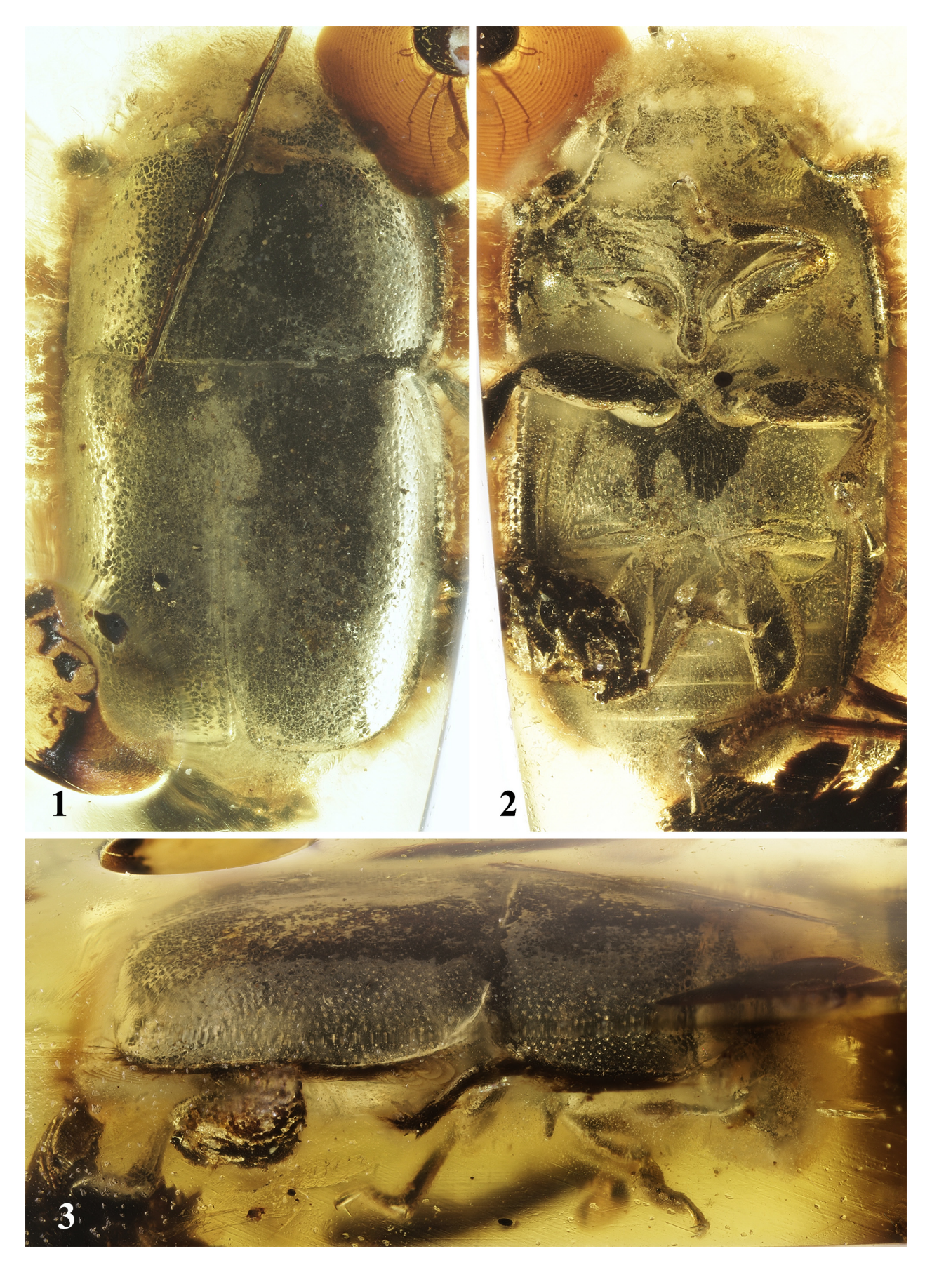
FIGURES 1–3. Melipriopsis baltica sp. nov. , holotype, No 6897 [MAIG], habitus: 1 – dorsal view; 2 –ventral view; 3 – right lateral view. Body length 3.8 mm.