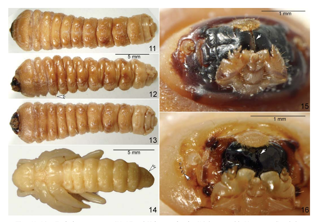
Figs. 11–16. Trichoferus campestris (11–15) and Hylotrupes bajulus (16; intercepted in Vancouver, Canada in sea cargo dunnage from Hong Kong), larvae and pupa. 11–13) (Intercepted in Vancouver, Canada in sea cargo dunnage from Korea), grown larva, dorsal view (11), left lateral view (12, arrow indicates right hind leg) and ventral view (13); 14) Pupa, dorsal view (arrow indicates sclerotized spines; intercepted in Vancouver, Canada in sea cargo dunnage from P. R. China); 15–16) Head, frontal view (left arrows indicate the lowest stemma on the vertical row of three right stemmata; right arrows indicate the spoon-shaped mandibular apices characteristic of Cerambycinae larvae).

for the North American Cerambycidae (Linsley 1962; Yanega 1996; Turnbow and Thomas 2002; Lingafelter 2007) lead to the native H. pubescens, the only species of the Trichoferus-Hesperophanes complex native to the Western Hemisphere (Figs. 3, 6). Hesperophanes pubescens is distributed throughout eastern North America from Quebec and Ontario south to Georgia and Alabama and west to Minnesota and Iowa (Linsley 1962), is rarely encountered, and its host plant, an undetermined oak species (Quercus sp.), was only recently discovered (Vlasak and Vlasakova 2002). Both species are known to occur near Montreal, Quebec (McNamara 1991). Adults of T. campestris are somewhat darker (Figs. 1, 2 as compared to Fig. 3) and can be distinguished from H. pubescens by the presence of a few sparse, long, erect setae protruding above the pubescence (Fig. 5; best visible on lateral side of pronotum just dorsal to the profemora). Cerambycidae pupae are too inadequately known to allow pupal diagnosis of T. campestris (Fig. 14), although the latter has unusual sharp, sclerotized dark projections on abdominal terga I-VI, most developed on tergum VI. Mature larvae of the