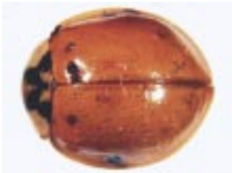
Multicolored Asian LB (spotless form)

Adult multicolored Asian lady beetle occurs in many forms with different spots and color. The common form is orange with or without spots. Body length is about 8 mm.