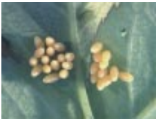
LB egg mass