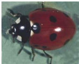
Adult sevenspotted LB

Adult LB are generally convex-shaped, brightly-colored or dark with or without spots, and range in size from 1 mm to 10 mm.