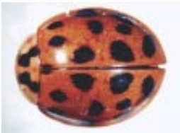
Multicolored Asian LB (spotted form)