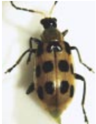
Spotted cucumber beetle