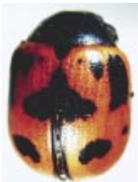
Labidomera sp. (leaf beetle)