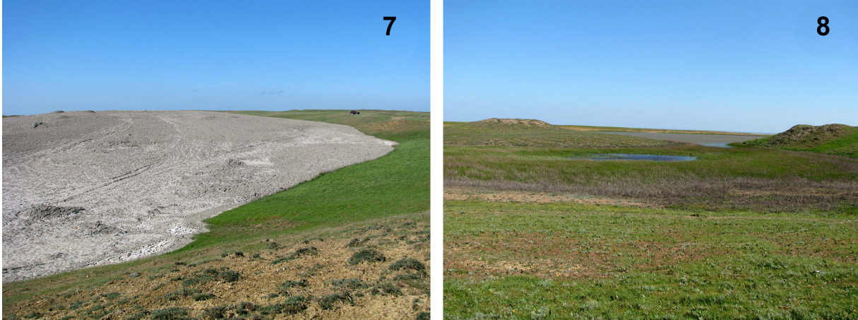
Fig. 1–8. Achenium volcanus sp. n. 1 – habitus; 2–6 – aedeagus: 2 – view from the parameral side; 3 – view from the side opposite to parameres; 4, 6 – opposite lateral views; 5 – enlarged view of the apical portion of aedeagus from lateral side; 7–8 – Karabetova hill chain of the Taman Peninsula, habitats: 7 – clay field produced by the mud volcano; 8 – temporary water pond. Puc. 1–8. Achenium volcanus sp. n.

1 н. табитус; 2–6 – эдеагус: 2 – вид со стороны прикрепления парамер; 3 – вид с противоположной стороны; 4, 6 – вид сбоку (противоположные боковые стороны); 5 – увеличенный вид вершинной части эдеагуса сбоку; 7–8 – местообитания Карабетовой Гряды Таманского полуострова: 7 – поле глины, изверженной грязевым вулканом; 8 – временный водоем.