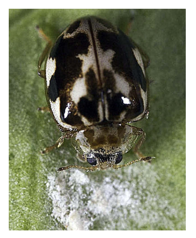
Fig. 1. Adult Psyllobora vigintimaculata , a North American mycophagous coccinellid, grazing on a patch of powdery mildew fungi.

The specialized feeding exhibited by the Halyziini and Tytthaspidini is apparently facilitated by unique mandibular morphology. The typical bifed mandibular apex of all Coccinellinae is modified in the Halyziini such that the ventral tooth is further divided into a row of additional teeth (Samways et al., 1997). Furthermore, the inner mandibular cutting edge of Coccinellini is smooth, while in the fungal-feeding tribes it is covered in minute teeth, forming a comb. These structures are presumed to help the insects to rake fungal spores from conidial towers and spore-laden hyphae growing on leaf surfaces (Ricci, 1982; Lawrence, 1989; Samways et al., 1997). In the polyphagous Tytthaspidini these comb or rake-like structures may also serve as tools for removing individual pollen grains, and fungal spores may be an alternative or incidental food