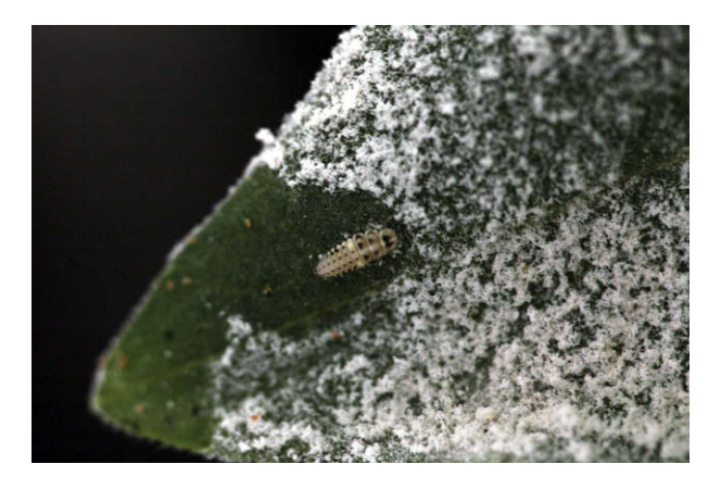
Fig. 4. An individual Psyllobora vigintimaculata larva feeding on the powdery mildew (PM) Erysiphe chicoracearum infecting Zinnia elegans "Peter Pan". Leaf area exposed to and fed upon by the larva is visibly discernable from unexposed PM-infected leaf area.

unexposed to larvae via the counting of conidia with a haemocytometer. The authors reported a 92% reduction in conidial density in leaf sections fed upon by the beetles. Leaf area cleaned by P. bisoctonotata was quantified using excised leaf sections and a leaf surface scaler. Third and fourth instars were the most efficient consumers in terms of leaf area cleaned per unit time.