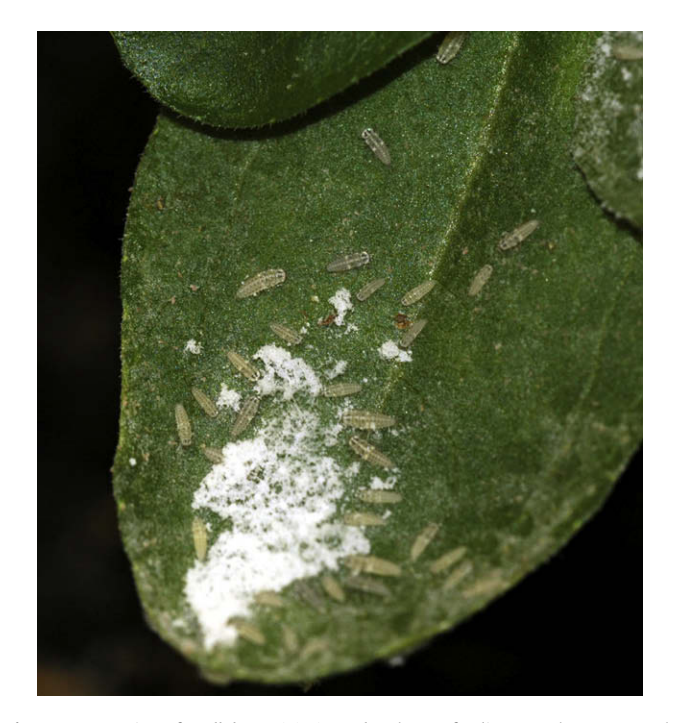
Fig. 3. Aggregation of Psyllobora vigintimaculata larvae feeding together on a patch of the PM Erysiphe chicoracearum infecting Zinnia elegans .

Soylu and Yigit (2002) stained okra leaves infected with PM E. cichoracearum with lactophenoltryphan blue and examined them using light microscopy, revealing that larvae and adults of Psyllobora bisoctonotata (Mulsant) fed upon mycelia as well as conidia and conidiophores on the leaf surface. Spore solutions were made from infected leaf areas exposed to larvae and compared with those