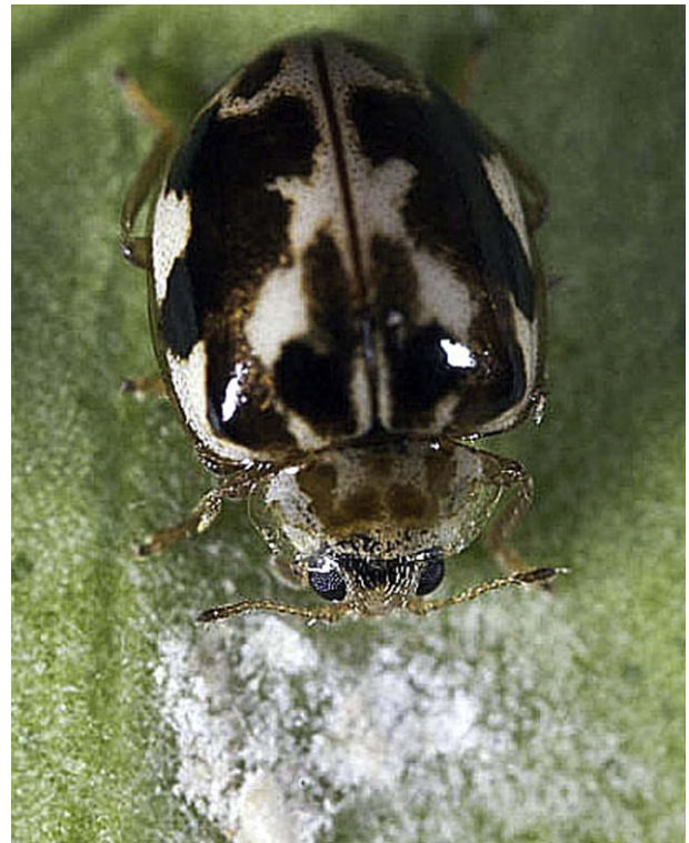
Fig. 1. Adult Psyllobora vigintimaculata , a North American mycophagous coccinellid, grazing on a patch of powdery mildew fungi.

The specialized feeding exhibited by the Halyziini and Tytthaspidini is apparently facilitated by unique mandibular morphology. The typical bifid mandibular apex of all Coccinellinae is modified in the Halyziini such that the ventral tooth is further divided into a row of additional teeth (Samways et al., 1997). Furthermore, the inner mandibular cutting edge of Coccinellini is smooth, while in the fungal-feeding tribes it is covered in minute teeth, forming a comb. These structures are presumed to help the insects to rake fungal spores from conidial towers and spore-laden hyphae growing on leaf surfaces (Ricci, 1982; Lawrence, 1989; Samways et al., 1997). In the polyphagous Tytthaspidini these comb or rake-like structures may also serve as tools for removing individual pollen grains, and fungal spores may be an alternative or incidental food