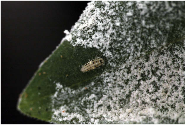
Fig. 4. An individual Psyllobora vigintimaculata larva feeding on the powdery mildew (PM) Erysiphe cichoracearum infecting Zinnia elegans “Peter Pan”. Leaf area exposed to and fed upon by the larva is visibly discernable from unexposed PM-infected leaf area.

unexposed to larvae via the counting of conidia with a haemocytometer. The authors reported a 92% reduction in conidial density in leaf sections fed upon by the beetles. Leaf area cleaned by P. bisoconotata was quantified using excised leaf sections and a leaf surface scaler. Third and fourth instars were the most efficient consumers in terms of leaf area cleaned per unit time.