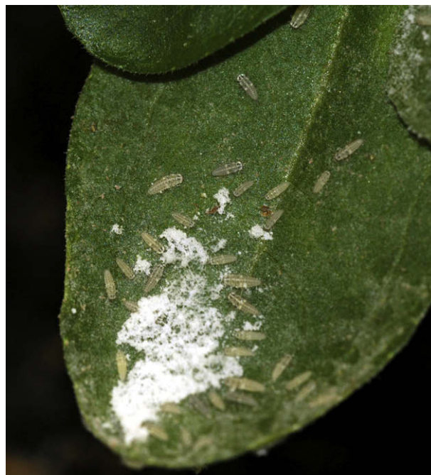
Fig. 3. Aggregation of Psyllobora vigintimaculata larvae feeding together on a patch of the PM Erysiphe chioracearum infecting Zinnia elegans .

Soylu and Yigit (2002) stained okra leaves infected with PM E. chioracearum with lactophenoltrypan blue and examined them using light microscopy, revealing that larvae and adults of Psyllobora bisoctonotata (Mulsant) fed upon mycelia as well as conidia and conidiophores on the leaf surface. Spore solutions were made from infected leaf areas exposed to larvae and compared with those