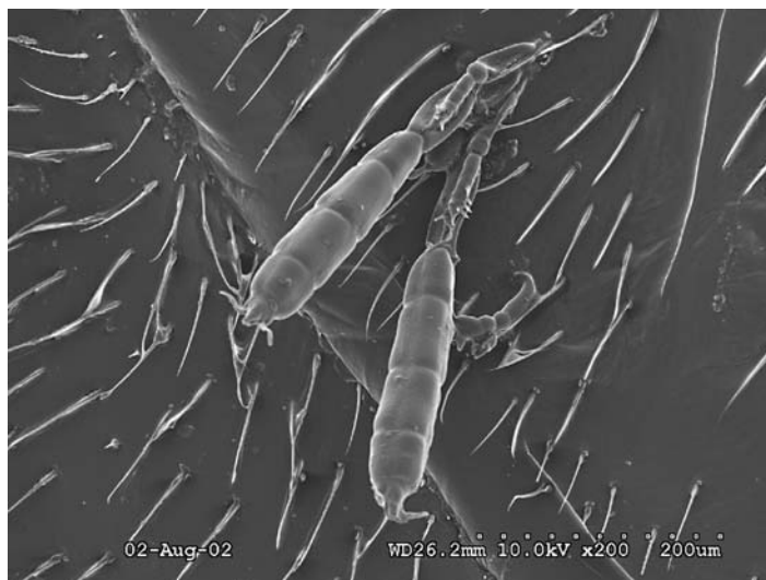
Fig. 2. SEM of Hesperomyces virescens on the integument of Harmonia axyridis demonstrating morphological characteristics of the fungus.