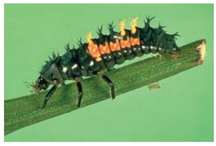
Harmonia axyridis, multicolored Asian lady beetle larva. (312)