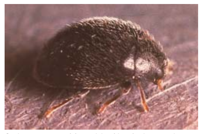
Stethorus punctum picipes, adult spider mite destroyer that specializes in controlling spider mite populations. (314)