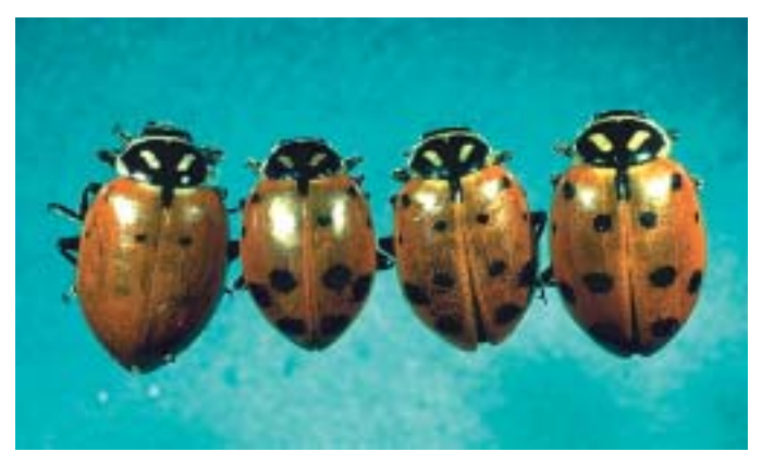
Hippodamia convergens , convergent lady beetle adults. (308)

Prey species: Lady beetles feed on a range of insects, including aphids, scales, mealybugs, whiteflies, and occasionally spider mites and insect eggs. The convergent lady beetle, Hippodamia convergens , which prefers aphids, is one of the most common species in the North Central United States. It is available commercially and has been widely distributed. An introduced species, the multicolored Asian ladybeetle, Harmonia axyridis , feeds on aphids and scale insects on trees and commonly invades homes by the thousands in the fall.