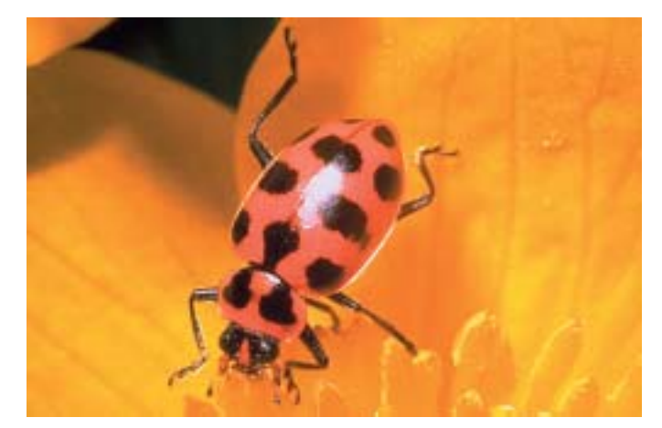
Coleomegilla maculata, pink lady beetle (or 12-spotted lady beetle) adult feeding on pollen. (317)