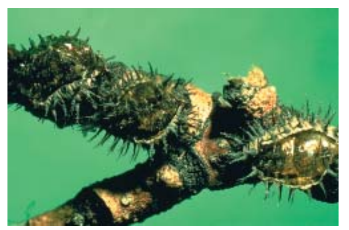
Chilocorus species pupate in their last larval skins, which are spiny. (320)