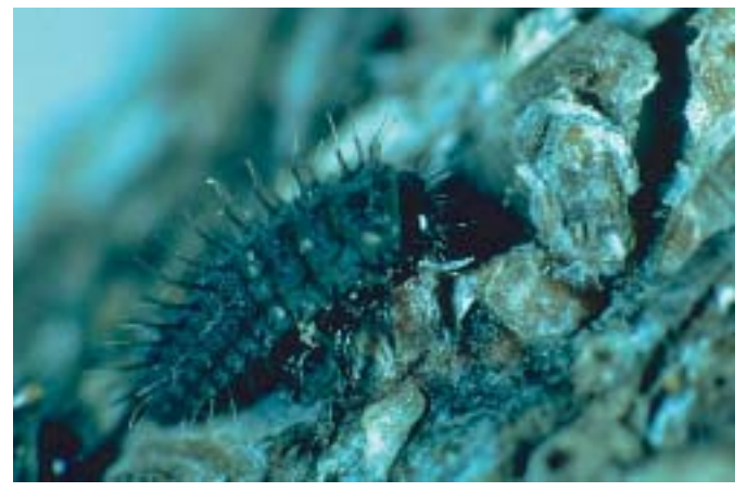
Chilocorus stigma, twicestabbed lady beetle larva. Larvae have spines, and adults are black with two small red spots. This genus commonly attacks armored scale insects. (316)