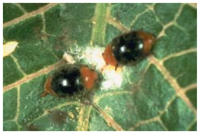
Cryptolaemus montrouzieri, mealybug destroyer adults feeding on a mealybug egg mass. (313)