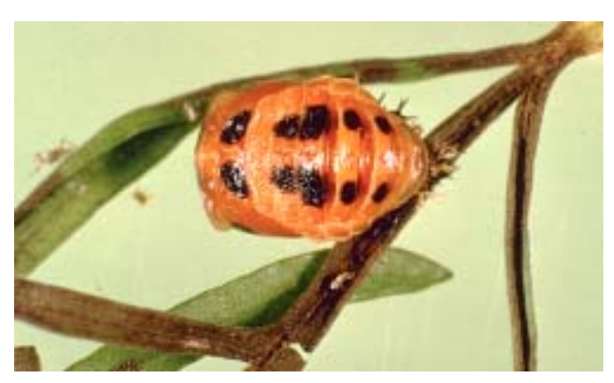
Harmonia axyridis, multicolored Asia lady beetle pupa. (315)