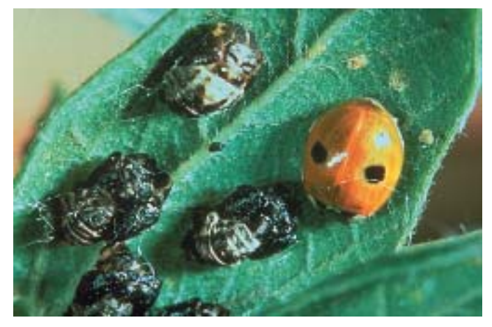
Adalia bipunctata, twospotted lady beetle adult and pupa with shed pupal skins. (318)