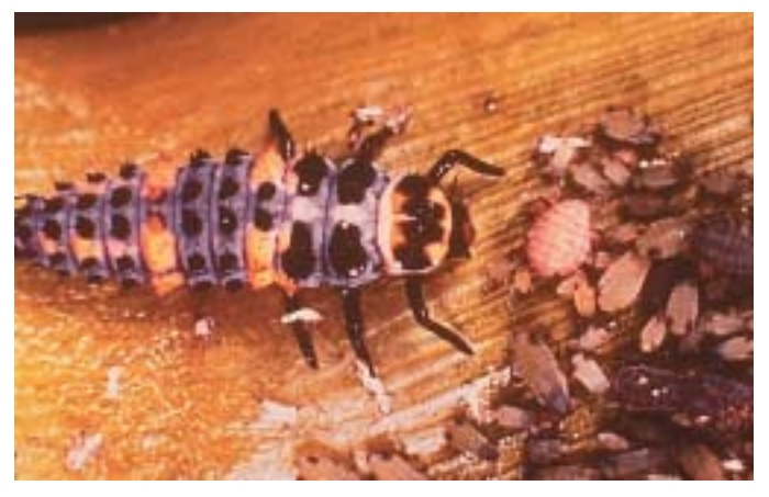
Hippodamia convergens , convergent lady beetle larva. (311)