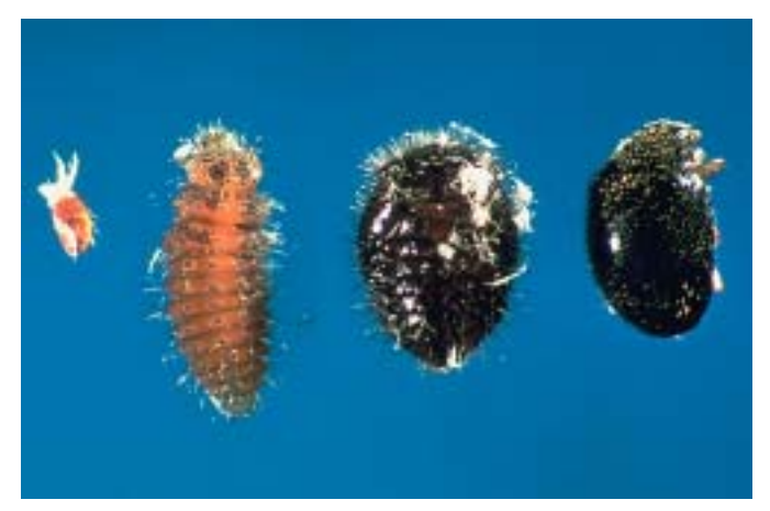
From left to right: a spider mite, and three life stages of Stethorus, larva, pupa, adult. (319)