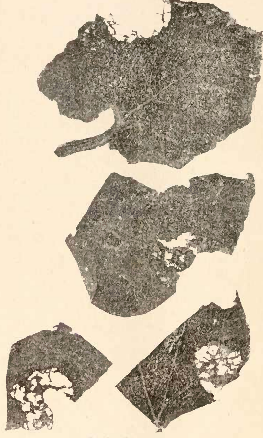
Fig. 1.-Eaten leaf,

In the accompanying figure the characteristic injury is well shown. The beetle gnaws through the epidermis on the upperside, in the form of a more or less well marked semicircle and within this it feeds, sometimes