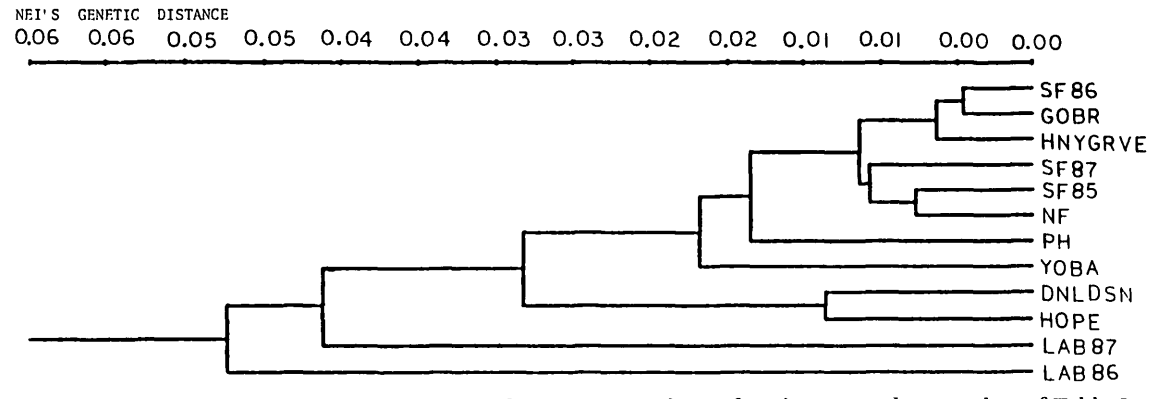
FIG. 2. Phenogram based on the unweighted pair group analysis of Nei's genetic distance data of Table 3. Software program NTSYS-PC (Numerical Taxonomy and Multivariate Analysis System) version 1.50 by F. James Rohlf (Exeter, New York, NY) was used to generate this dendrogram. Observed clustering of populations follows their geographic distribution.

Nei's genetic distance estimates (Table 3) indicates that all populations are genetically very similar. The dendrogram generated from this data is found in Fig. 2. It indicates that the populations tend to cluster on geographic location. For example, the Hope and Donaldson populations are from Arkansas whereas Gober, Honeygrove, and Yuba are farther south. The Prairie Home population was collected in 1986, the same year as the Lab 86 population but 64 km to the West of Lab 86. The South Farm populations, although collected in different years clearly cluster together and include a population from New Franklin, 32 km to the north. The Texas populations which form a subcluster with South Farm