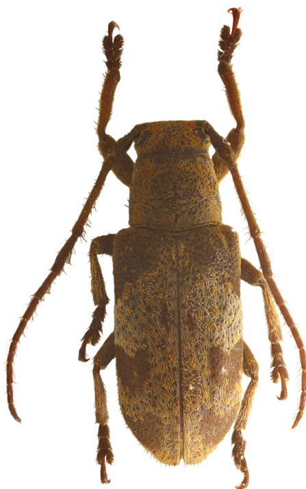
Fig. 1. Holotype of Synixais luzonica sp. n.

Pronotum almost cylindrical, flattened, slightly widened basally, dark-brown, covered with