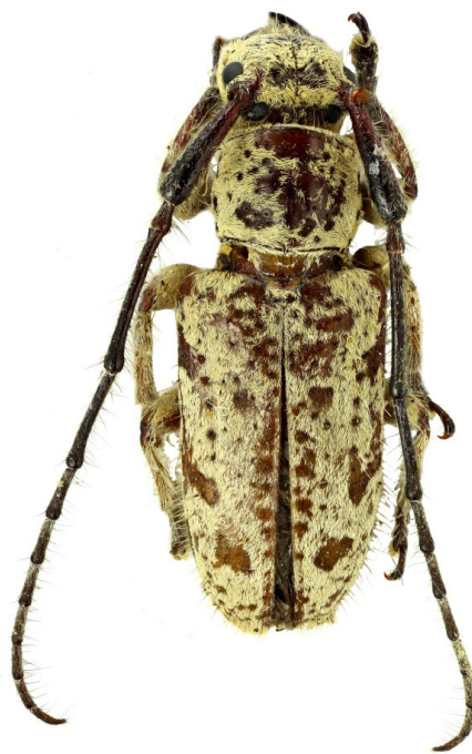
Fig. 2. Holotype of Synixais mindoroense Barševskis, 2019