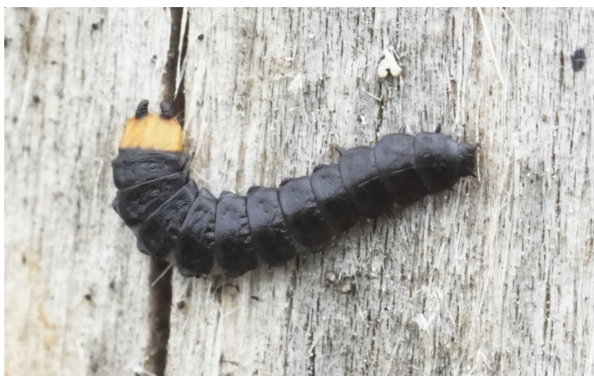
Fig. 5. Lygisterus sanguineus (Linnaeus, 1758) larva. Dorsal view (specimen of Jyväskylä, Finland), photo courtesy of Raimo Peltonen, Finland.

roundish, larger at base, and with few ventral setae; femur elongated, robust, with ventral setae; tibia (tibiotalarsus) elongated and thinner