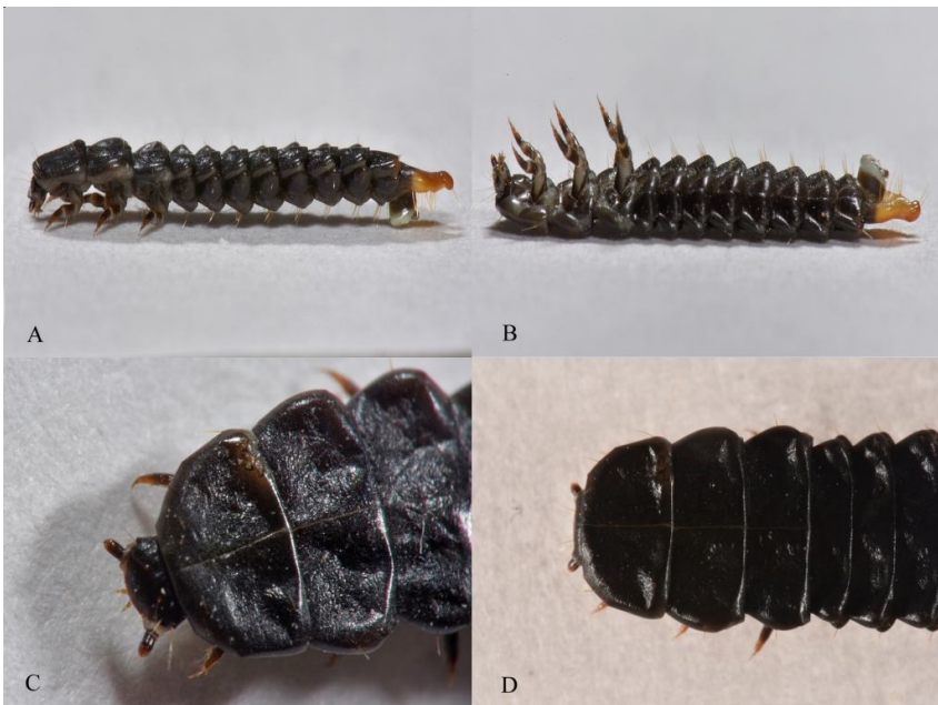
Fig. 3. Lygisterus anorachilus Ragusa, 1883 larva. A. lateral view; B. ventro-lateral view; C. detail of head and thoracic terga; D. detail of thoracic terga and first abdominal segments.