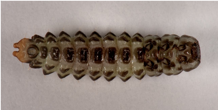
Fig. 2. Lygisterus anorachilus Ragusa, 1883 larva. Ventral view (specimen of 23 XI 2017)