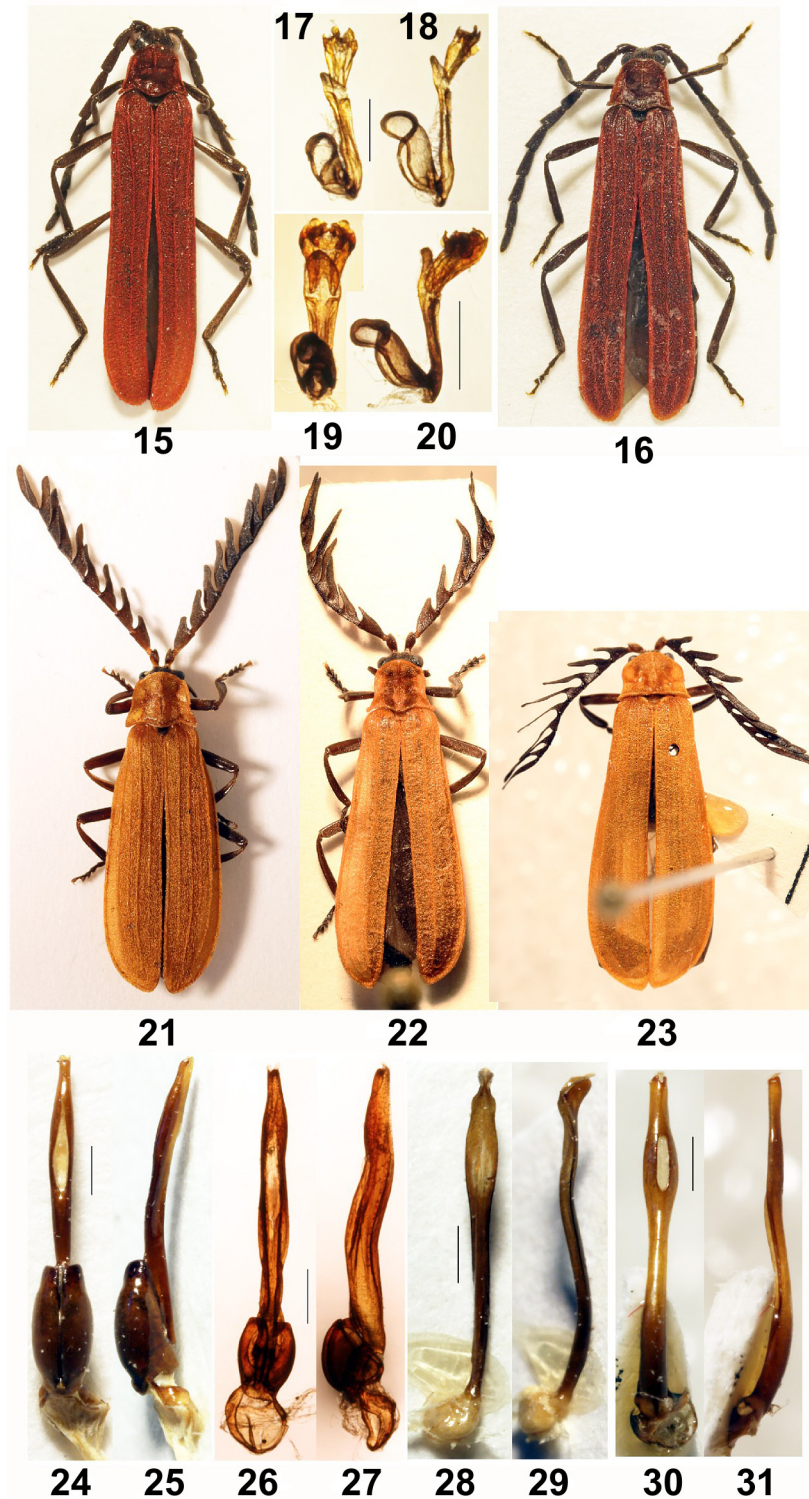
Figs 15–31. General view and aedeagi of Mesolyclus fedorenkoi sp. n. (15, 17, 18 – holotype male), Mesolyclus rubromarginatus sp. n. (16, 19, 20 – holotype male), Macrolyclus holzschuhi sp. n. (21, 26, 27 – holotype male), Cerceros chapaensis sp. n. (22, 28, 29 – holotype male), Cerceros drymophilus sp. n. (23, 30, 31 – holotype male) and Macrolyclus bowringi (24, 25 – male).

15, 16, 21–23 – general view; 17–20, 24–31 – aedeagi. 17, 19, 28 – ventrally; 18, 20, 25, 27, 29, 31 – laterally; 21–24, 26, 30 – dorsally. Scale: 0.5 mm.