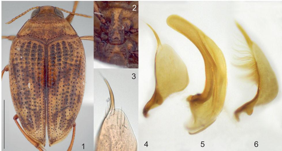
Figs. 1–6: Haliplus abbreviatus , specimen A, Karatau Mts., collected at light; 1) habitus; 2) prosternal and metaventral process; 3–4) left paramere; 5) penis; 6) right paramere. Scale bar = 1 mm.