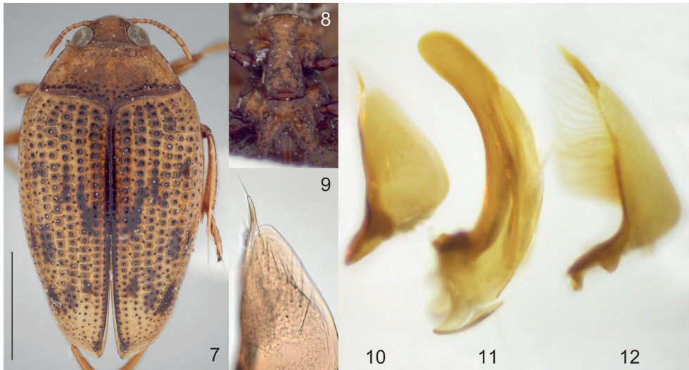
Figs. 7–12: Haliplus abbreviatus , specimen B, Karatau Mts., collected at light; 7) habitus; 8) prosternal and metaventral process; 9–10) left paramere; 11) penis; 12) right paramere. Scale bar = 1 mm.

In the material from Karatau Mountains one male has a well developed parallel digitus, two males have a short digitus and the remaining five males lack a digitus. The male from Kyzylorda Region has an elongated triangular appendix instead of the digitus (Figs. 15–16). The males from the South Kazakhstan Region have no digitus.