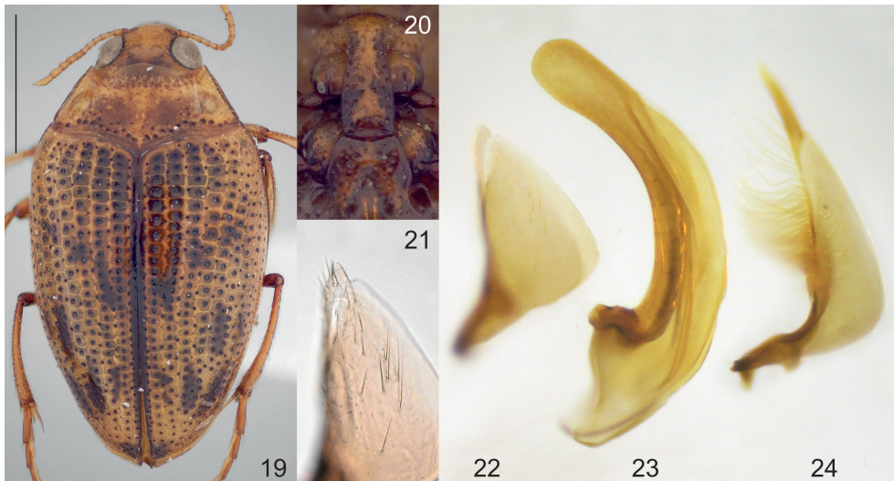
Figs. 19–24: Haliphus abbreviatus , specimen D, Karatau Mts., collected at light; 19) habitus; 20) prosternal and metaventral process; 21–22) left paramere; 23) penis; 24) right paramere. Scale bar = 1 mm.

We strongly believe that all these specimens belong to one species and that the presence or absence of a digitus on the left paramere has no taxonomic value. In this case, H. kulleri has to be regarded as conspecific with H. abbreviatus . As a consequence, H. jaechi and H. ortalii also have to be considered as junior synonymies of H. abbreviatus .