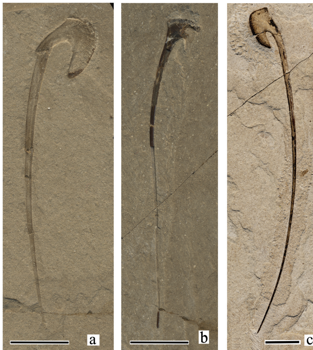
Fig. 1. Gill rakers of basking sharks from Sakhalin Tertiary. Specimens ZIN 306p-1 (a) and ZIN 306p-2 (b) from Holmsk Formation and ZIN 307p (c) from Kurasi Formation. Scale bar: 10 mm.

is about 67% of the base height. The base is very high (Fig. 2b). The medial process is short, comparatively wide, of triangle shape, with a slightly convex mesial edge and a rounded apex. The basal protuberance is weak. The basal edge of the base is straight. Basal length is medium. The basal angle is subangular.