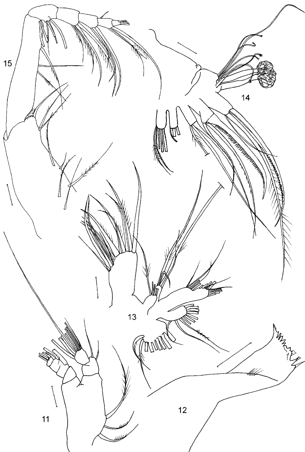
Figs 11–15. Phaennocalanus unispinosus gen. et sp. nov., female. 11. Mdp. 12. Gn. 13. Mx1. 14. Mx2. 15. Mxp. See text for abbreviations. Scale bar = 0.1 mm.