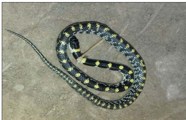
Fig. 2. MacKinnon's wolf snake ( Lycodon mackinnoni Wall, 1906). Specimen no. 1

The present collection describe elevation range of the distribution of L. mackinnoni at elevation range as follows: Chittra – 1965.65 m a.s.l., Pania – 1911.09 m a.s.l., Mang Bajri – 841.24 m a.s.l., Chitra vicinity – 1118.92 m a.s.l. and Chhattar – 783.94 m a.s.l., while formerly it was reported at maximum elevation range of 1860 m a.s.l. (Wall, 1906).