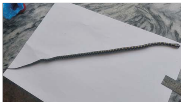
Fig. 4. MacKinnon's wolf snake ( Lycodon mackinnoni Wall, 1906). Specimen no. 3

have measurements 0.26 m and 0.25 m accordingly. The snout length of first three samples is nearly same (35.3, 35.2 and 35.0 cm respectively) as reported