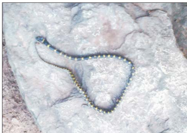
Fig. 6. MacKinnon's wolf snake ( Lycodon mackinnoni Wall, 1906). Specimen no. 5