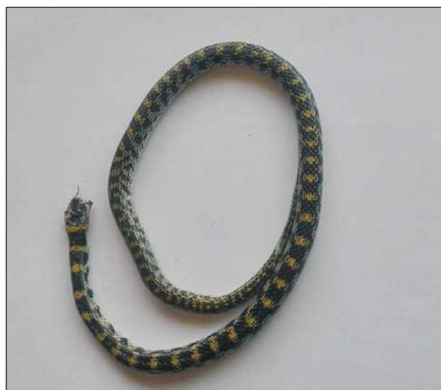
Fig. 5. MacKinnon's wolf snake ( Lycodon mackinnoni Wall, 1906). Specimen no. 4