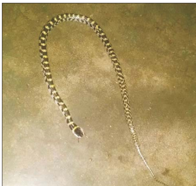
Fig. 3. MacKinnon's wolf snake ( Lycodon mackinnoni Wall, 1906). Specimen no. 2

The morphometric measurements of total body length (0.43, 0.42, 0.42 m) of three samples are approximately same as reported previously (Wall, 1906; Manhas et al., 2015), while the remaining two samples